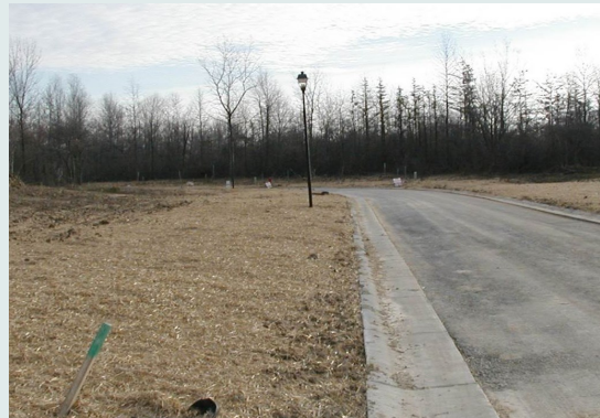
Example of permanent stabilization: seed covered by straw mulching

LORAIN SWCD 42110 RUSSIA RD. ELYRIA, OH (440) 326-5800