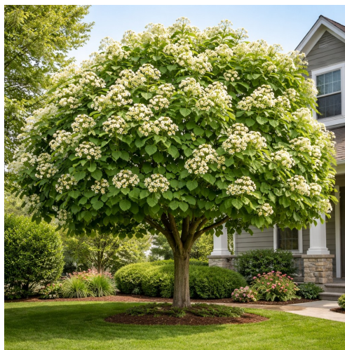
N. Catalpa is a great landscape tree with large, fragrant flowers & heart shaped leaves. Catalpa is often called cigar tree for its long, brown seed pods.

We are kicking off our Eleventh Annual Big Tree Contest starting right now! This year we are looking for Lorain County's biggest Northern Catalpa ( Catalpa speciosa ) tree. Each tree will receive a score based on trunk circumference, crown spread, and total height to determine the winner. This contest is sponsored by the Original Don Mould's Plantation. Please visit our website at www.lorainswcd.com/big-tree-contest or our Facebook page for contest rules.